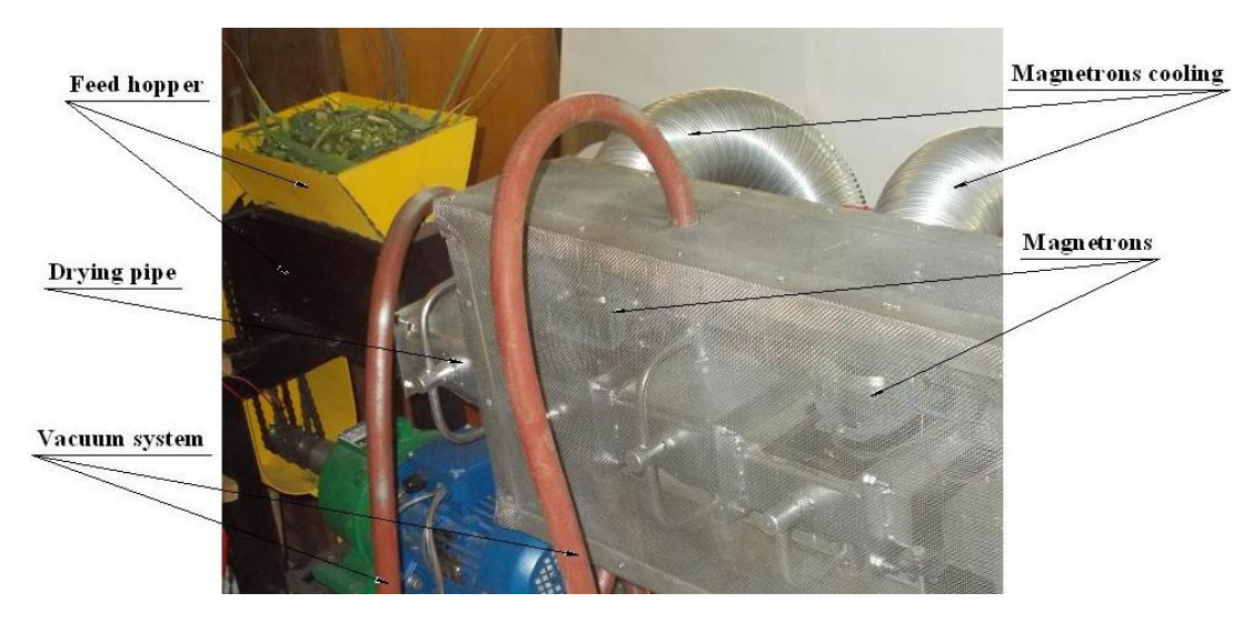
Fig. 2. Laboratory microwave-vacuum drying apparatus

The adequacy of the model has been verified on a developed laboratory microwave-vacuum drying apparatus of continuous operation for drying the vegetative mass [5] (Fig. 2).